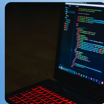
PC & MONITORS

Because we are a leading company in the field of information technology